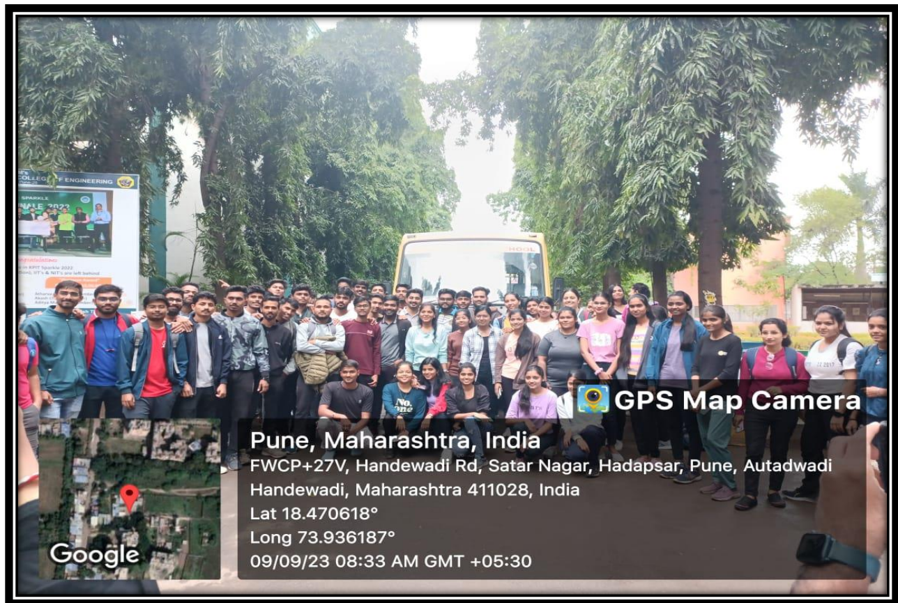
Students Gathered At College Campus