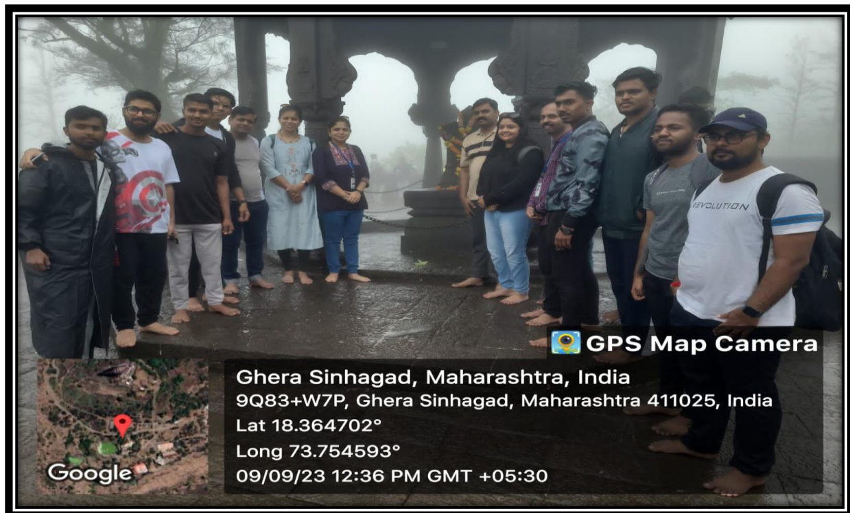
Statue Of Tanaji Malusare