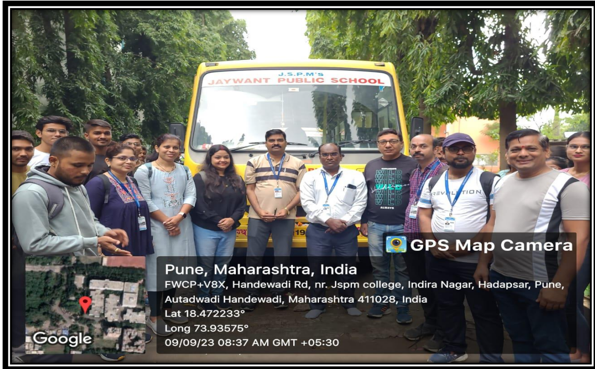
All The Faculty Members