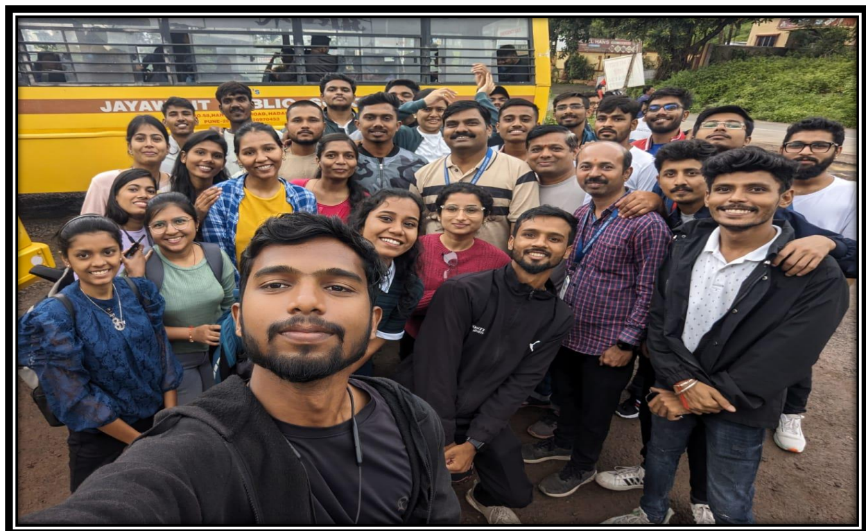
At Oscarwadi Misal