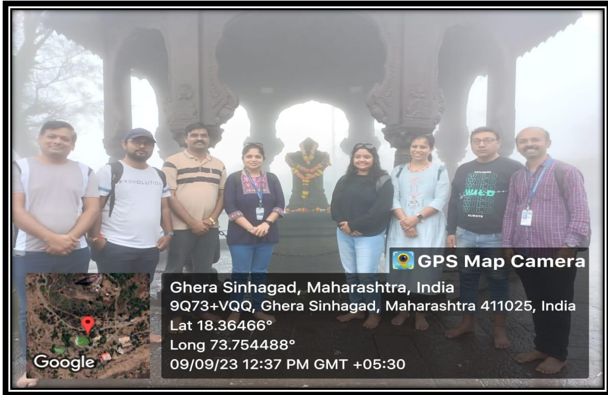
Statue Of Tanaji Malusare