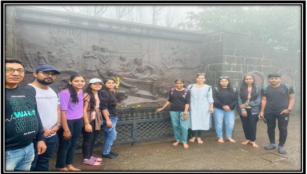
Sculpture wall relief of Tanaji Malusare with Chhatrapati Shivaji Maharaj near Samadhi at Sinhagad Fort